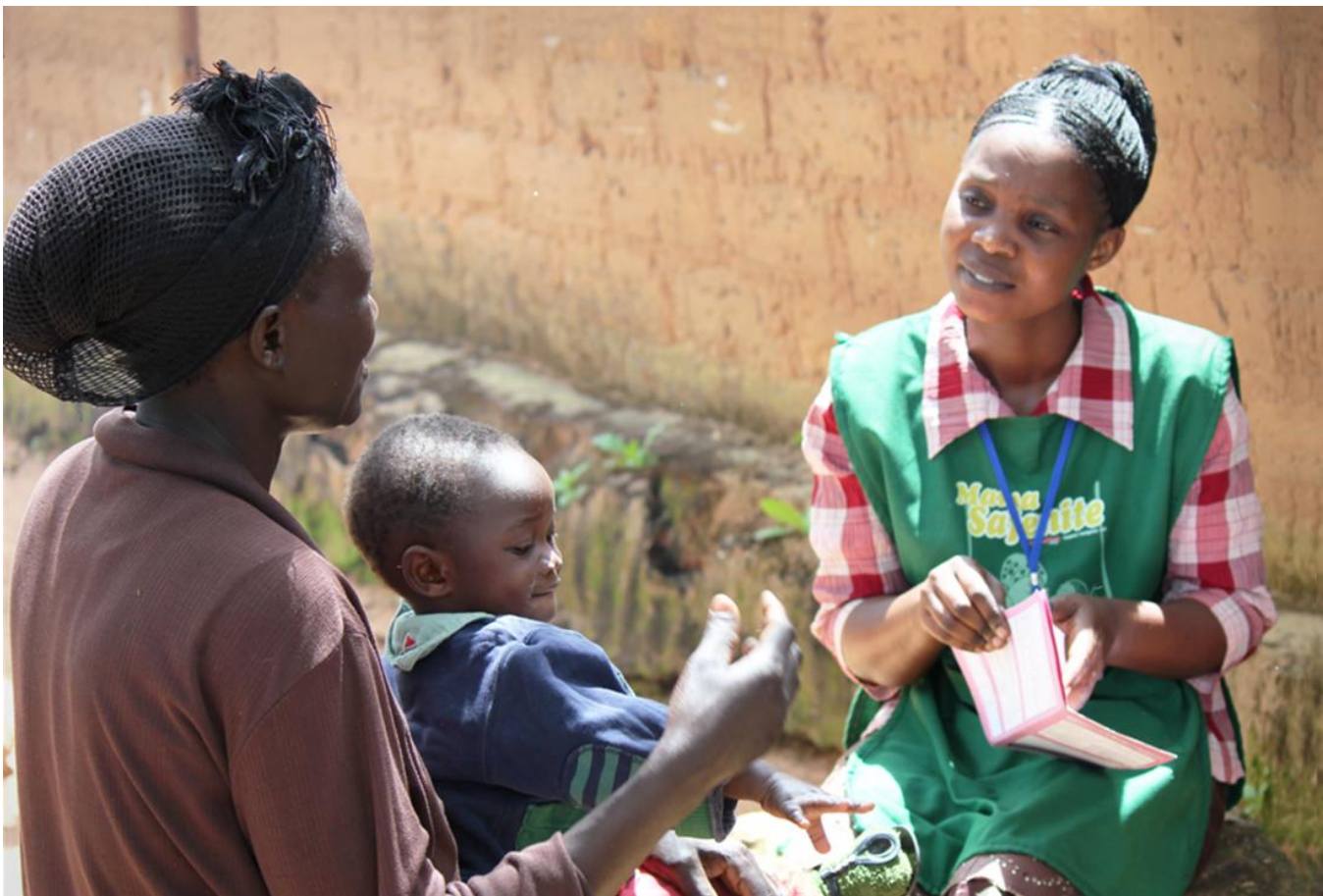
Community health worker talks to a patient in Zambia

As originally envisioned, after two years of service, CHAs are eligible for promotion to a higher-ranking position within the health system. They can also acquire additional training--paid for by the government --to become higher ranking and better-paid healthcare providers.