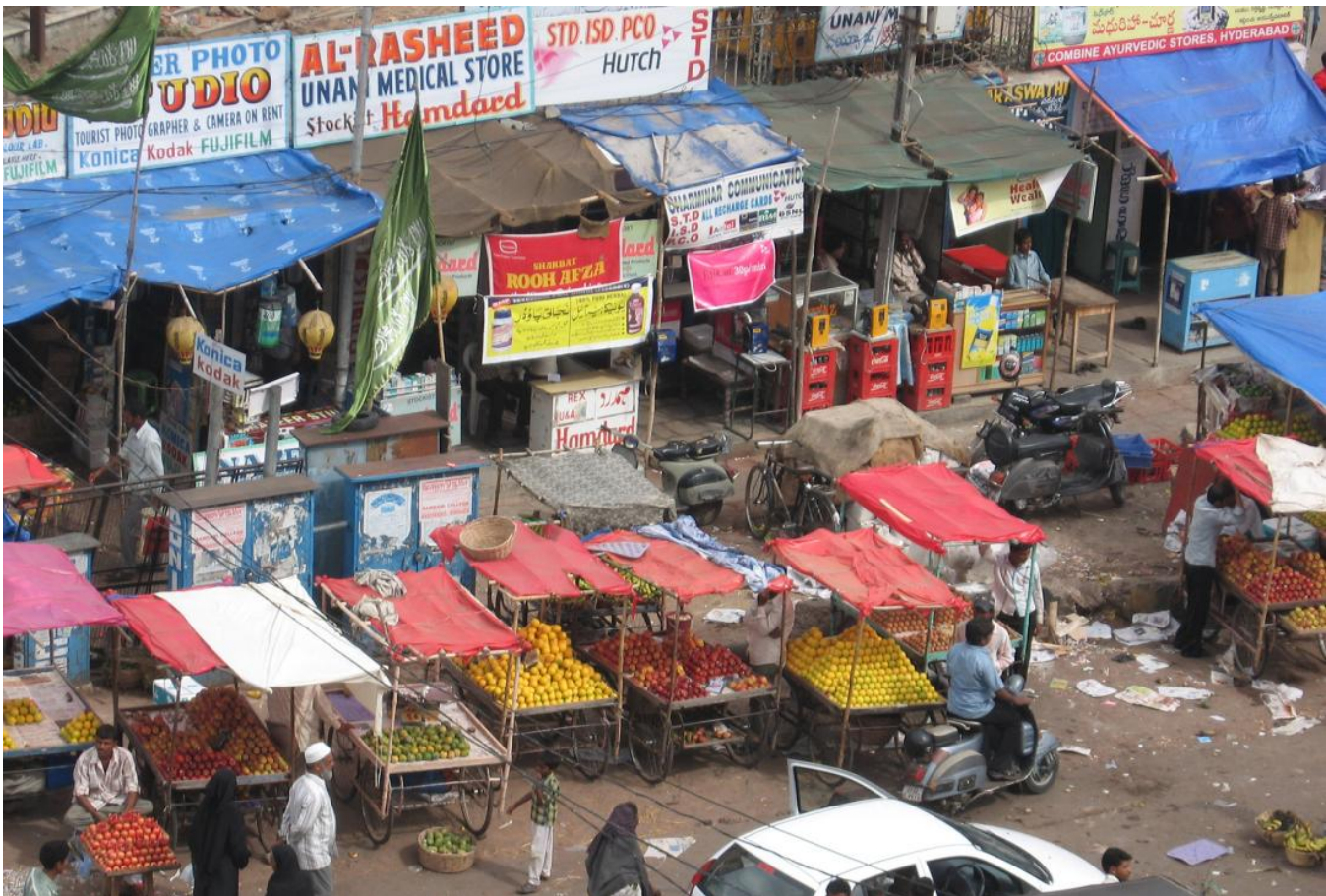
Small businesses in Hyderabad, India

Launched in 1998, Spandana is one of the largest and fastest growing microfinance organizations in India, with 1.2 million active borrowers in 2008. Spandana offers traditional microfinance loans, in which self-formed groups of six to ten women are given loans. A "center" is comprised of 25-45 groups, and to join an individual must (i) be female, (ii) be aged 18 to 59, (iii) have lived in the same area for at least one year, (iv) have valid identification and residential proof, and (v) at least 80 percent of women in a group must own their home.