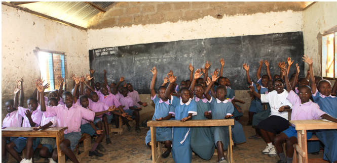
A classroom in Kenya.

Programs that reduce the costs of education increase student enrollment and attendance. However, there is considerable variation in the cost effectiveness of different programs.