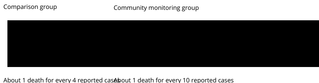
Figure 3 . Community monitoring reduced Ebola deaths from 1 in 4 to about 1 in 10 cases

Based on the project's success within the health sector, the Government of Sierra Leone scaled up the community monitoring intervention to cover additional sectors, including water, education, waste management, and social services. The planned expansion was delayed by the Ebola outbreak, but scale-up efforts resumed in 2016.