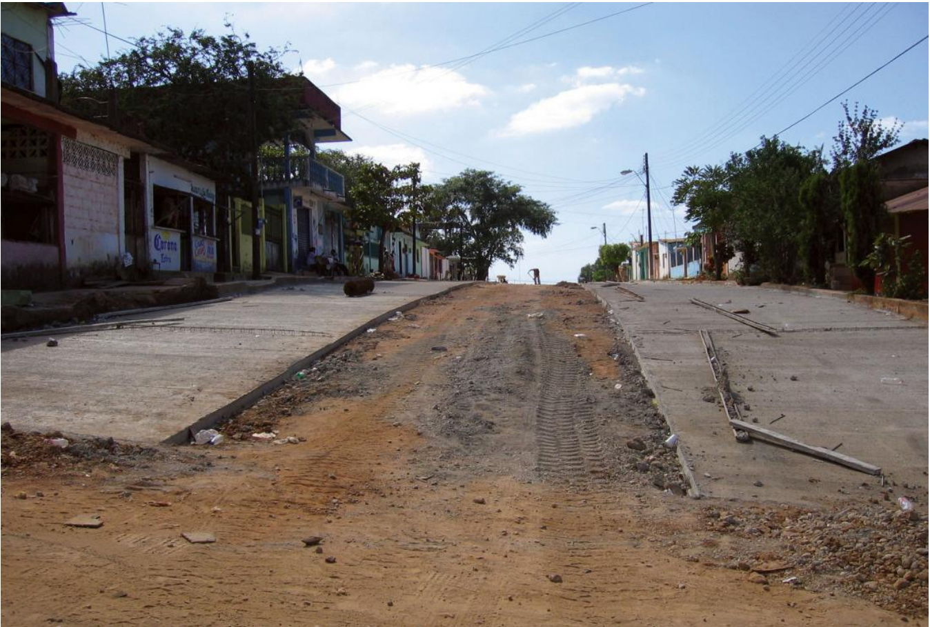
Road being paved in Acayucan, Mexico

income neighborhoods lie in the outskirts of the city and the local government has paved streets in these neighborhoods a few sections at a time. In Mexico, municipal governments are responsible for most elements of their urban infrastructure, but the municipal budget is primarily funded by federal taxes, with less than 10 percent derived from local taxes (consisting of the property tax and business-permit fees).